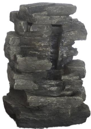
Fountain (3 LED lights and Pump pre-installed) 1x