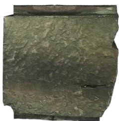
Fountain back Door 1x