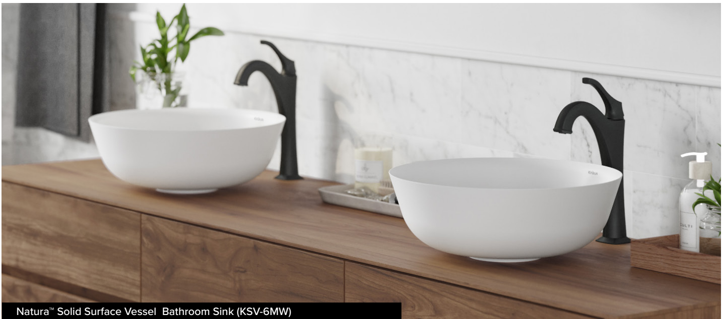
Natura™ Solid Surface Vessel Bathroom Sink (KSV-6MW)