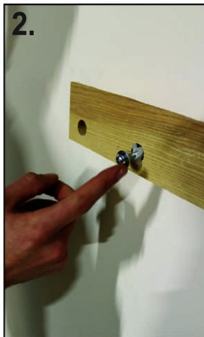
2. Thread the metal screw through the plastic washer until it threads till the wall