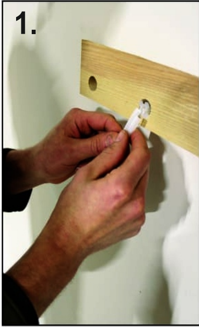
1. Insert the plastic dry wall anchor inside the hole drilled into the wall through the wooden support

ITEM DESCRIPTION : WALL MOUNTING BEDSIDE