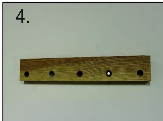
4. Fix all the screws firmly in the 5 slots provided