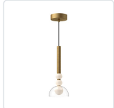
PD30502-BG/CL Brushed Gold/Clear