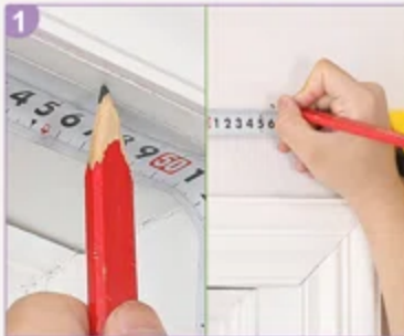
1 Mark install locations