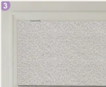
3 Mount shade in brackets