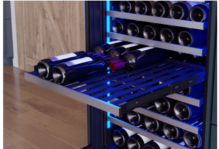
Full-Extension Wood Racks