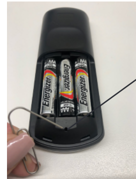
Hole Location for Pairing

Insert a Paper Clip Until You Hear a "Click" Sound