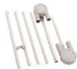
2. L/R joint leg