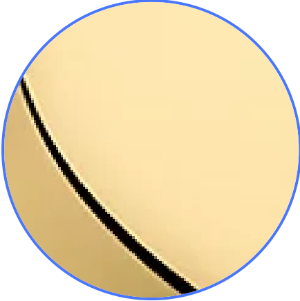
Lifetime (PVD) Polished Brass - 003