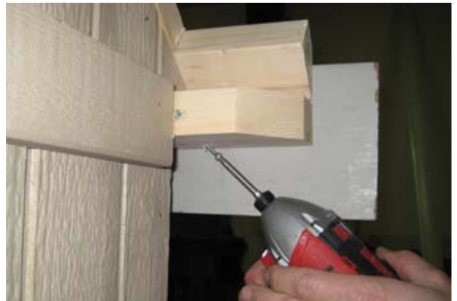
70. Secure with second screw from bottom up.