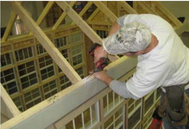
57. Secure with 2 1/2" screws.