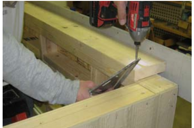
40. Make sure the top plate is flush on the inside as well as shown, before fastening.