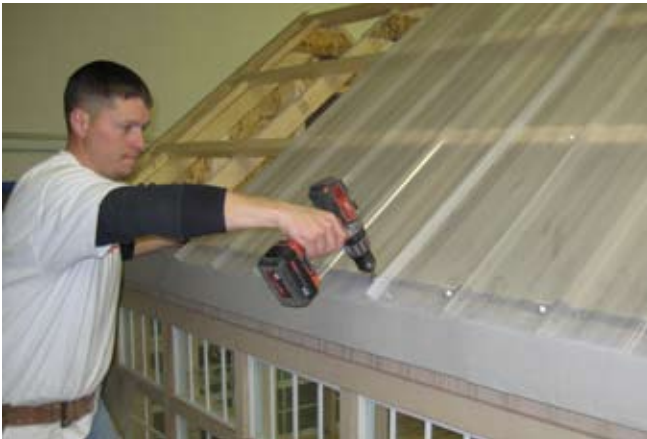
136. Make sure bottom over hangs 1"