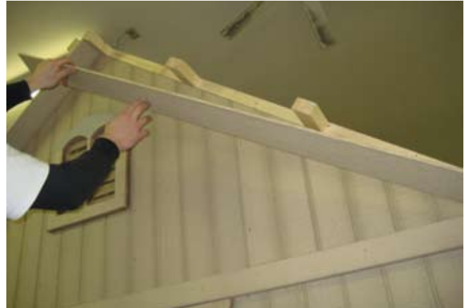
74. Install shorter piece.