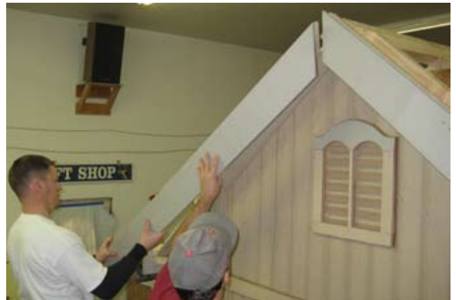
78. Install rake on left side and repeat from first one.