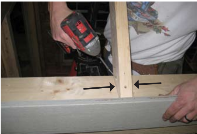
51. When securing truss use (3) 2 1/2" screws as shown (1) on top and (1) on each side of the truss.