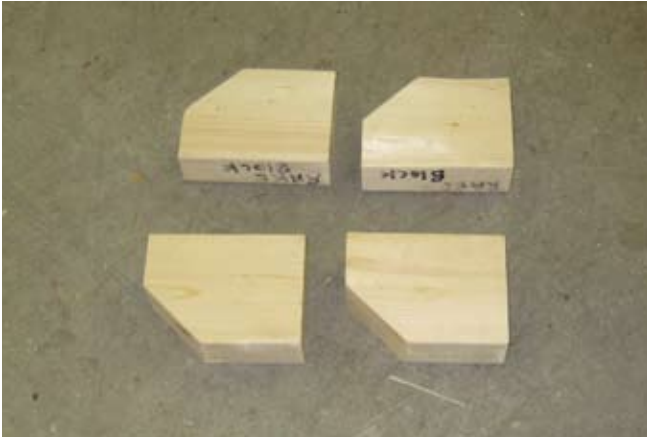
67. Locate rake blocks.