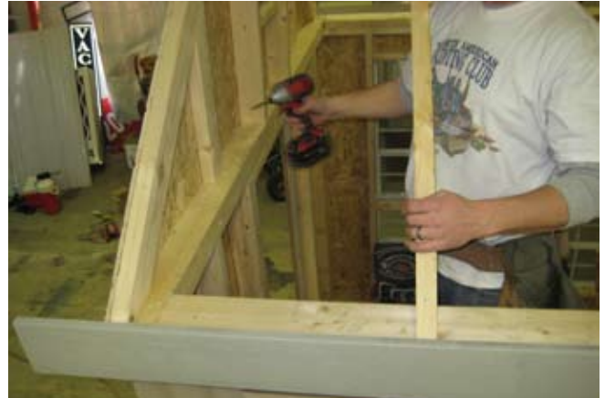
50. Next set trusses.