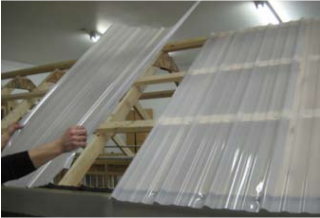
134. Continue with roof.