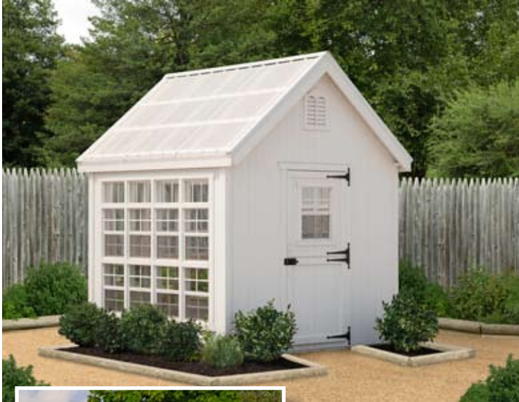
8x8 Colonial Greenhouse