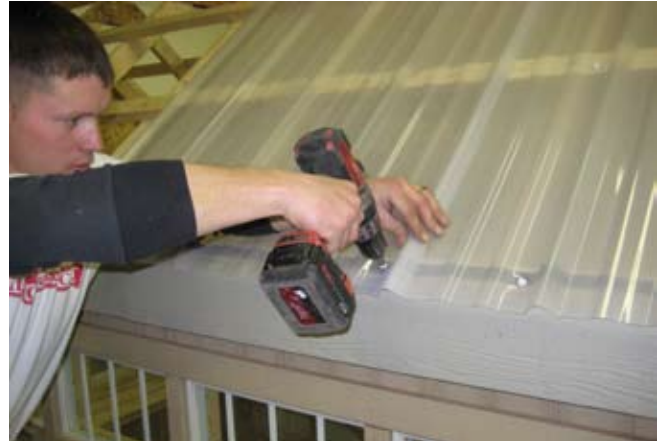
135. Continue installing.