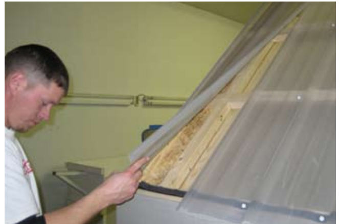
137. Next install last piece as shown.