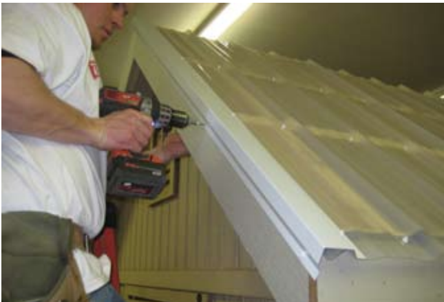
142. Secure with 1" white screw.