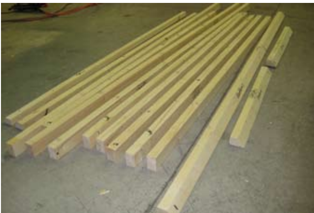
53. Next locate 2x3's for Purlins.