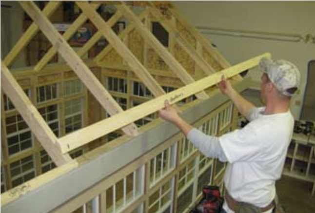
55. Continue with purlins.