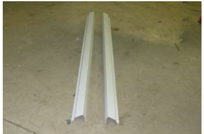
139. Locate metal rake covers.