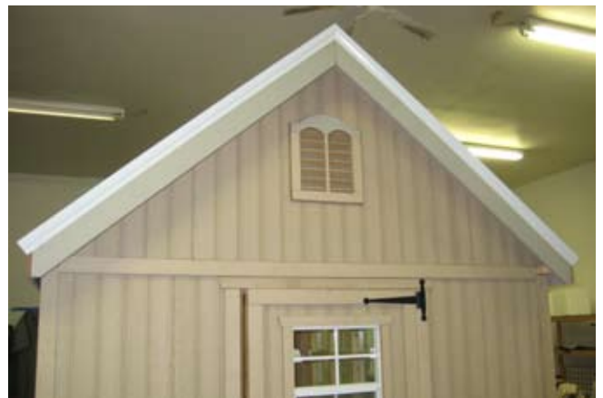
145. This is what it looks like when rake covers are done.