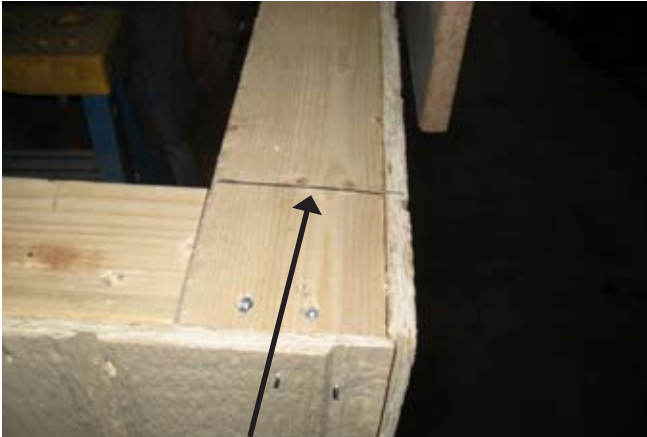
37. Wall is marked where top plate starts.