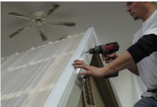
144. Continue with rake covers.