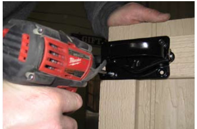
96. Secure with 1 1/4" black headed screws.