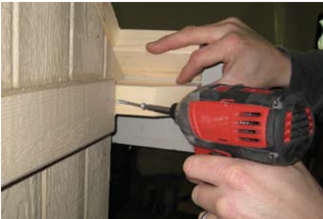
69. Secure with 2 1/2" screw as shown.