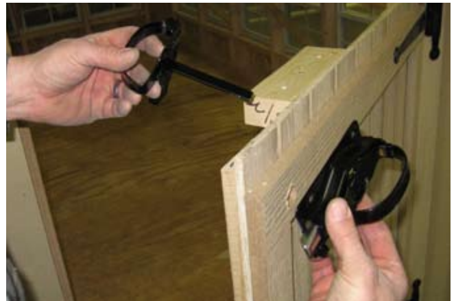
94. Next install door latch as shown.