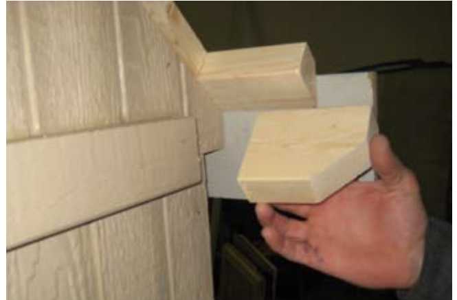
68. Install rake blocks as shown.