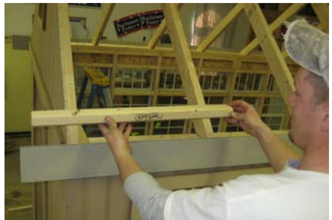
54. Purlins will be installed on top of trusses for Sunsky to set on.