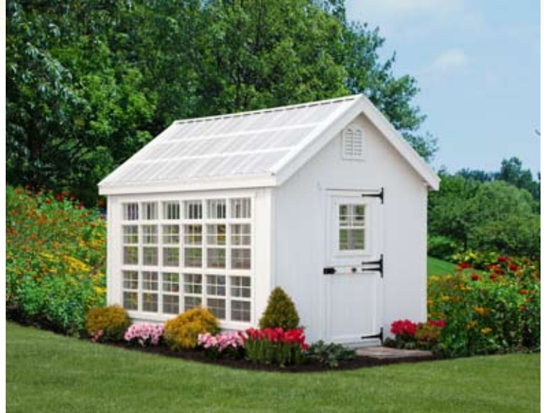
8x12 Colonial Greenhouse