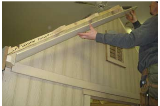
72. Install 7/16" siding for soffit as shown. Install longer piece first and then shorter one on the other side.