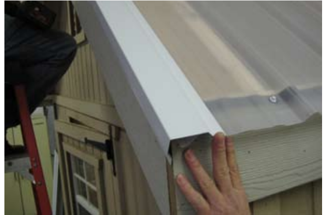
141. Keep bottom flush with sky light as shown.