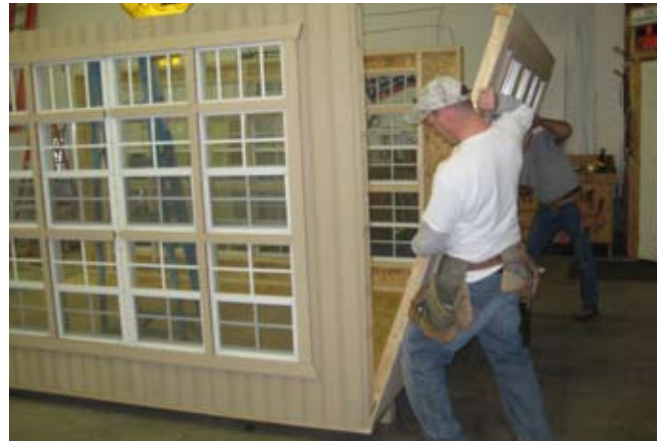
22. Next install end wall.