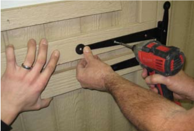
91. Secure with 2 1/2" black headed screws.