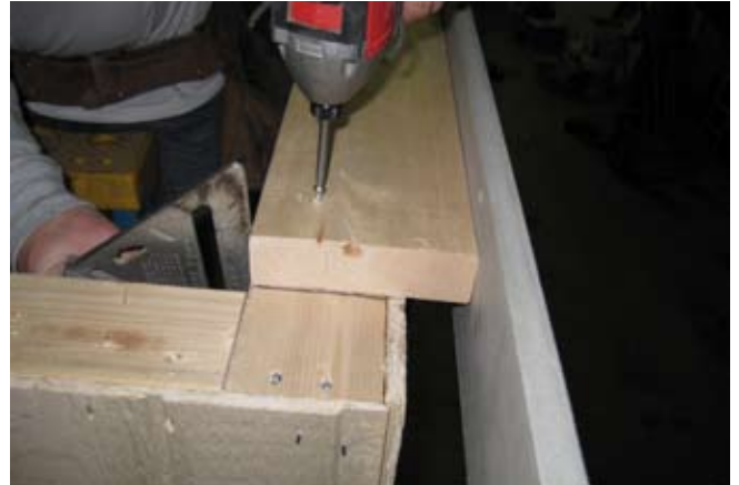
38. Next install top plate, make sure 2x6 is at the pencil mark as shown in the last picture.