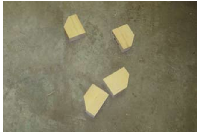
58. Locate 2x2 Bird Blocks.