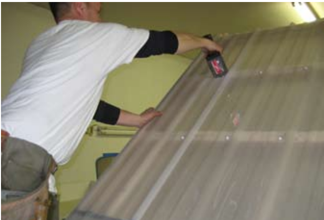
138. Continue with roof as shown.