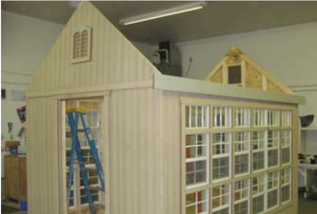
49. Gables are completed.