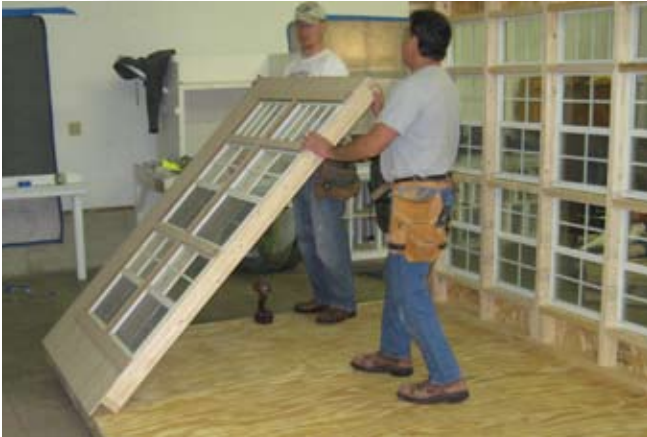
19. Set the next set of walls in place by letters.