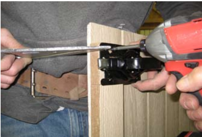
95. Make sure you use angle square as shown, so latch is flush with trim.