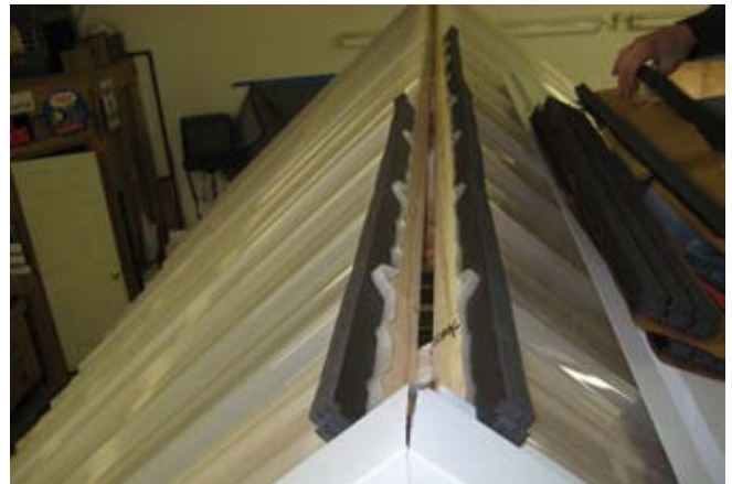
149. Continue installing enclosures.