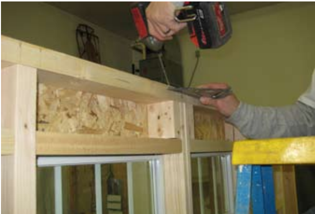
21. Make sure the walls are flush on the inside and secure with 2 1/2" screws as shown.