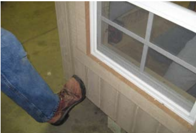
23. Apply pressure on outside while fastening with 2 1/2" screw from inside as shown.