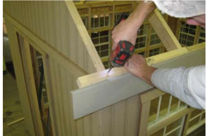
56. Purlins are marked so customer knows where to place them. Bottom row purlins are cut on an angle as shown.