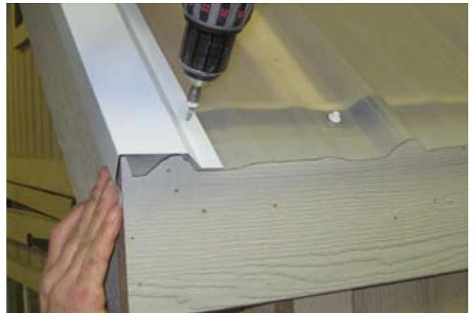
143. Insert screws so they line up with purlins as shown.