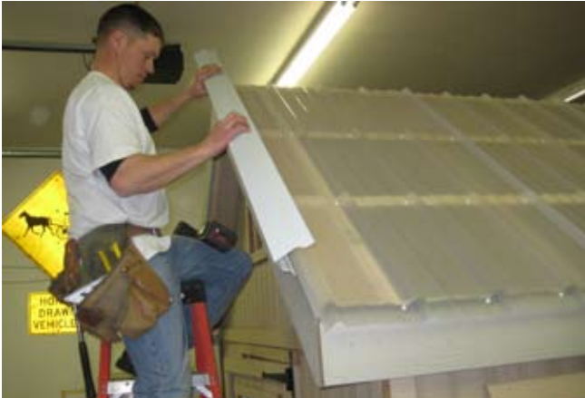
140. Install rake cover with wider side on top.