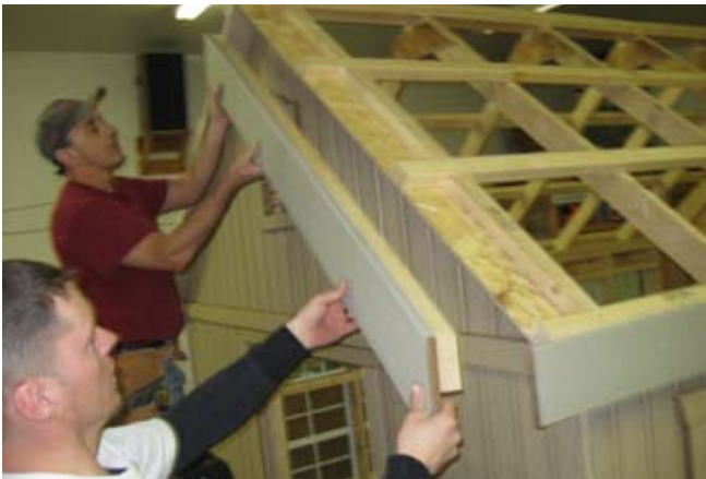
75. Next install rakes with trim on the outside as shown.