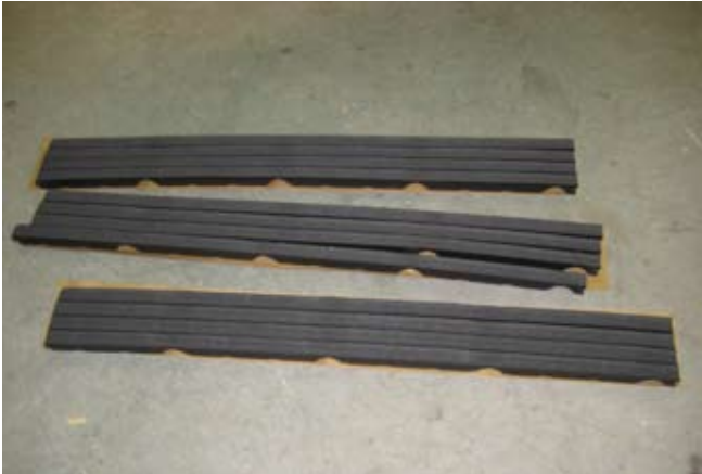
146. Locate ridge enclosures.