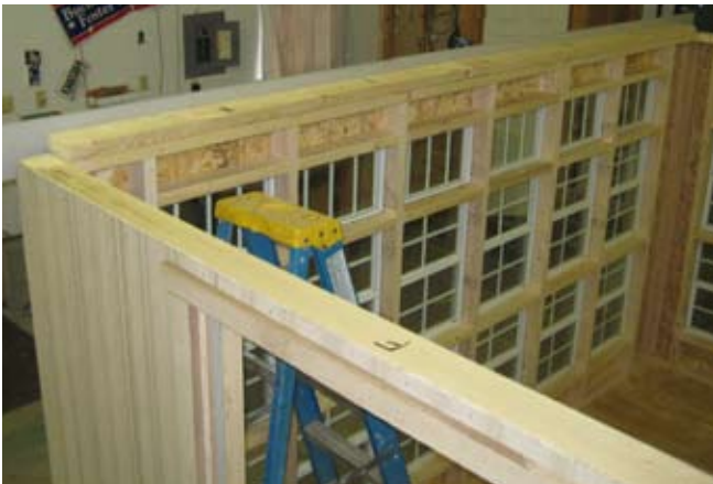
41. Top plates are complete.