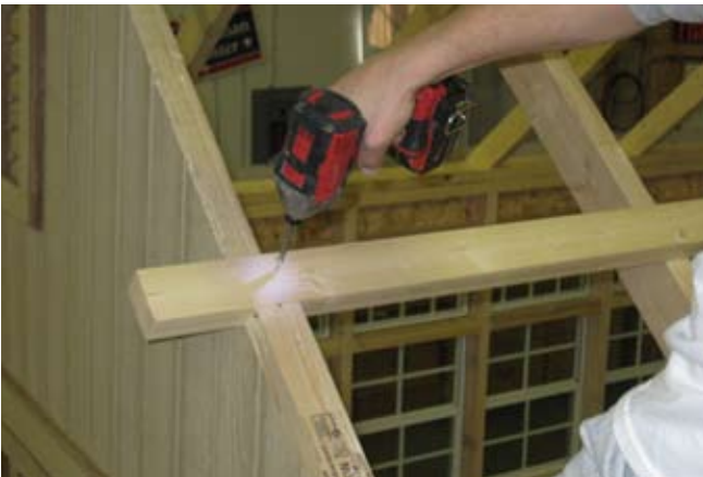
59. Next install second row of purlins as shown.