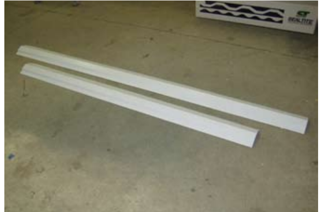
147. Locate ridge cap.