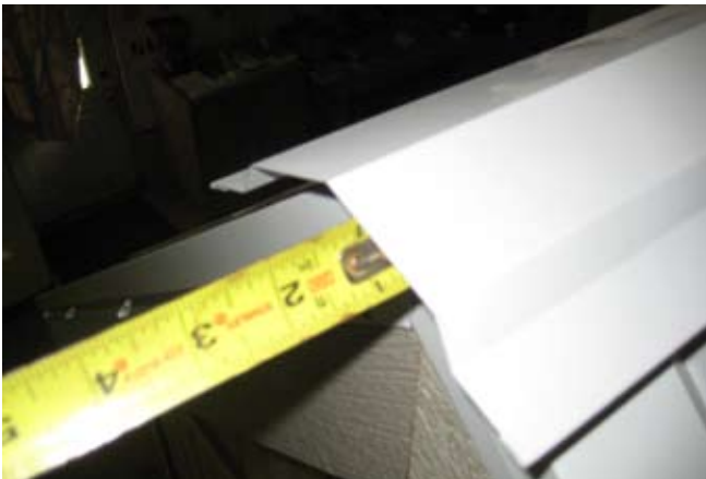
150. Next install ridge cap, over hang cap 1".