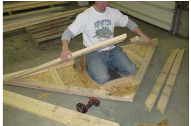
42. Next locate gable wall and use it for truss assemble as shown.