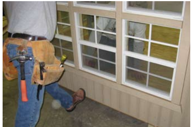
24. Apply pressure on all walls as shown before securing with 2 1/2" screws.