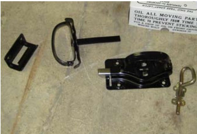
93. Locate door latch and barrel bolts.