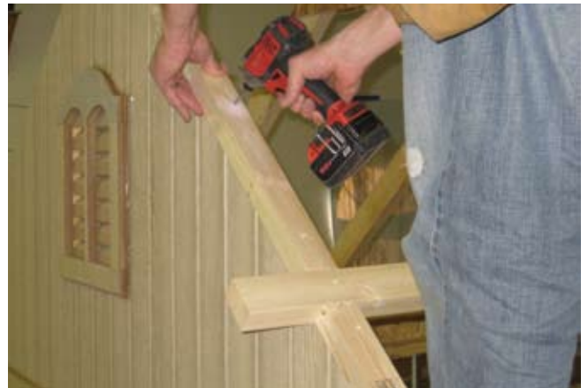
60. Install 2x2 bird block on gables after every row of purlins.