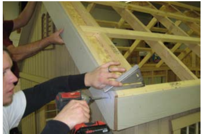
76. Make sure it is flush on the top of the purlins and secure with 2 1/2" screws.