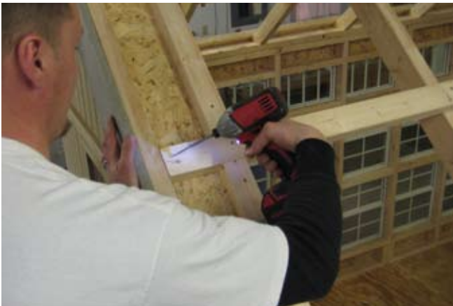
77. Continue with 2 1/2" screw going from top of purlin into the rake on an angle.