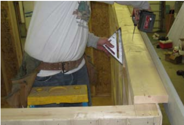
39. Fasten with 2 1/2" screws every 16" o.c.