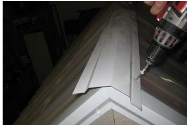
151. Secure ridge cap with 2" white screw beside every rib.