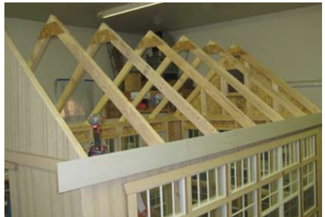
52. Trusses are completed.