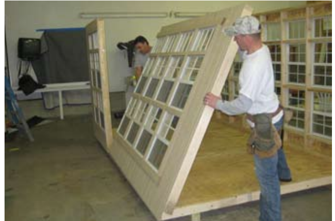
20. Continue with walls per diagram as shown.