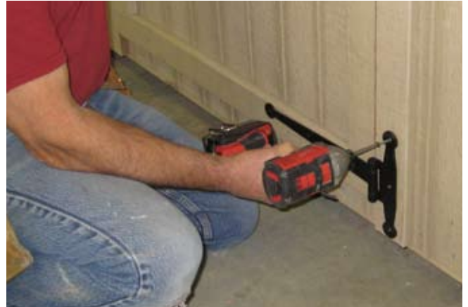
92. Next secure bottom hinge with 2 1/2" black headed screws.