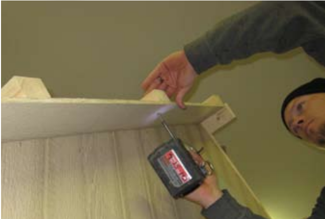
73. Secure with 1 1/4" screws.