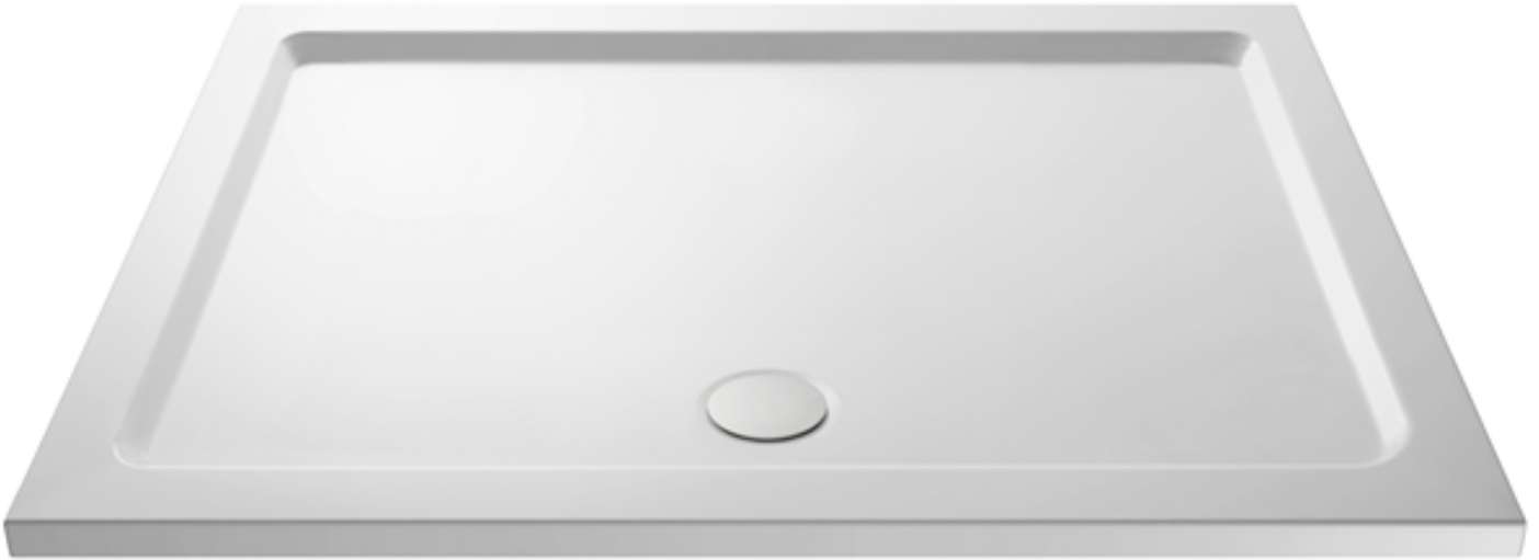
1700 x 700 RECTANGULAR TRAY