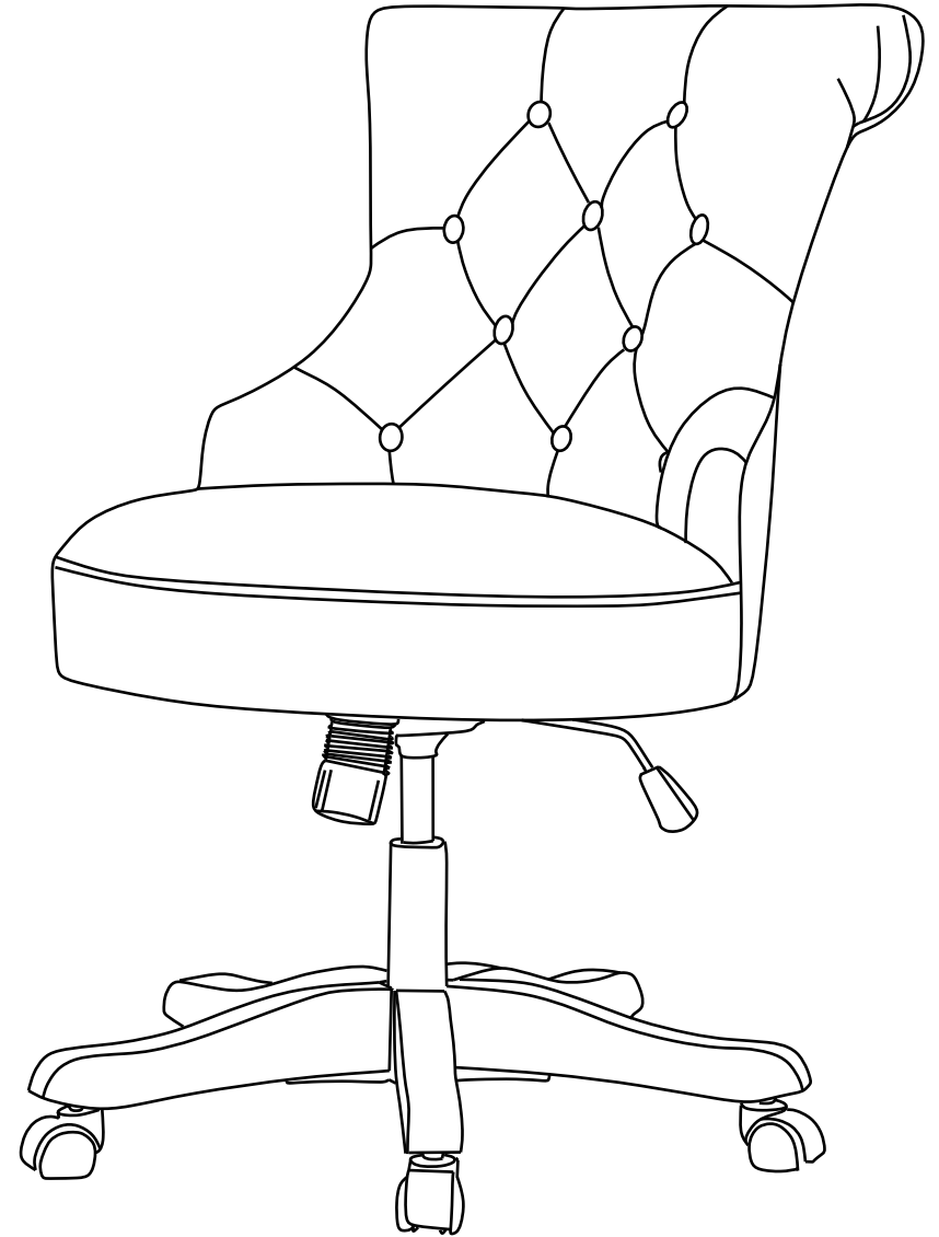
HOME OFFICE CHAIR