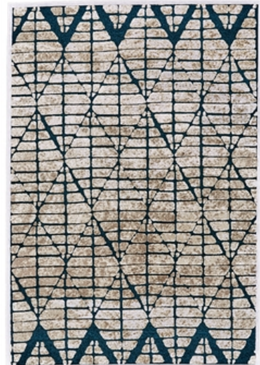
TEAL / WHITE