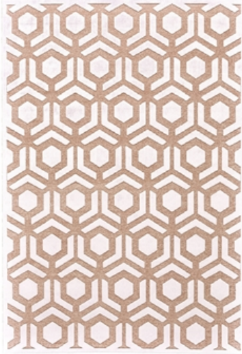
BLUSH / WHITE