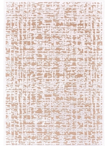
BLUSH / WHITE