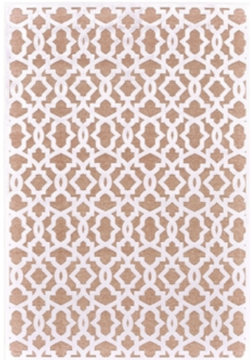
BLUSH / WHITE