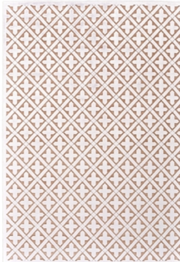
BLUSH / WHITE