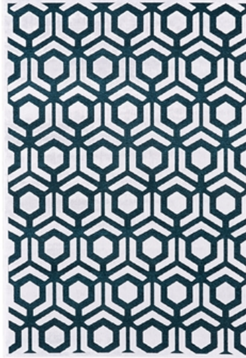
TEAL / WHITE