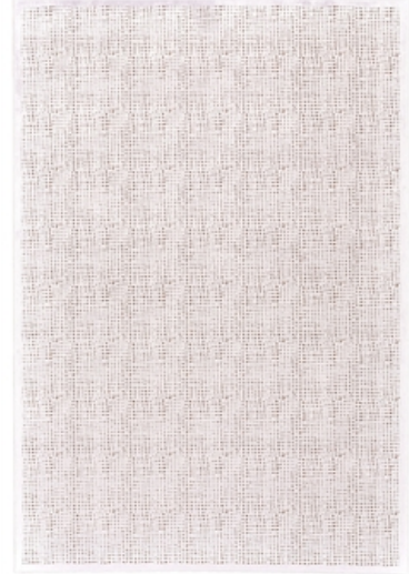
BLUSH / WHITE