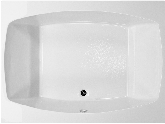
Features a textured bottom