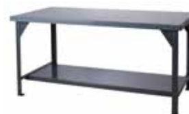
Heavy Duty Workbenches