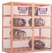
Safety Storage Products