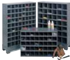
All Welded Parts Bins