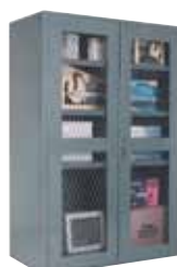
Heavy Duty Clearview Storage Cabinets