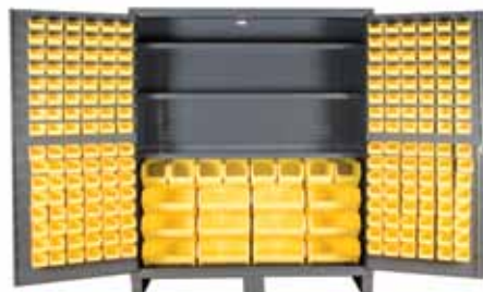
Heavy Duty Bin Cabinets