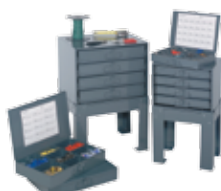
Scoop Compartment Boxes and Racks