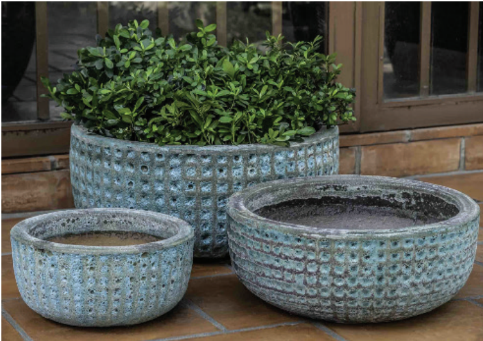
Shown in Verdigris