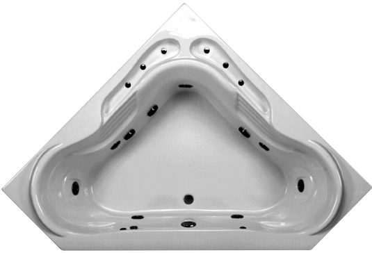
Shown with Standard Whirlpool package and optional Trim Kit.