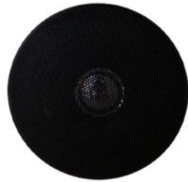
Bluetooth * : SAUNA BT