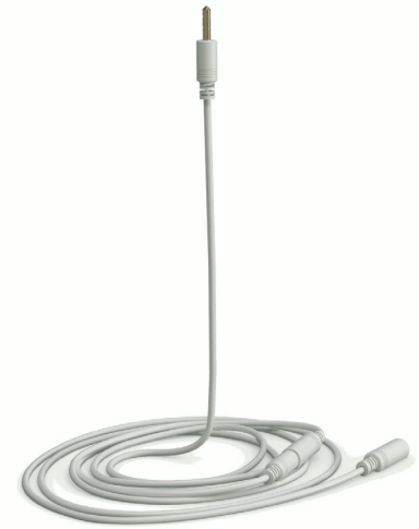
Flo by Moen™ Smart Water Detector 6' Leak Sensing Cable