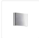
AT6506-BN Brushed Nickel