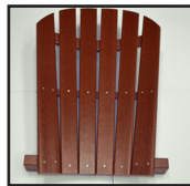
(1) SEAT BACK