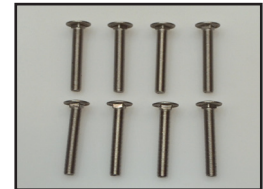
(8) 3" CARRIAGE BOLTS