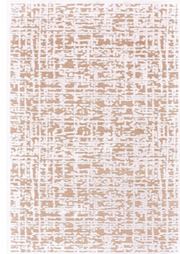
BLUSH / WHITE