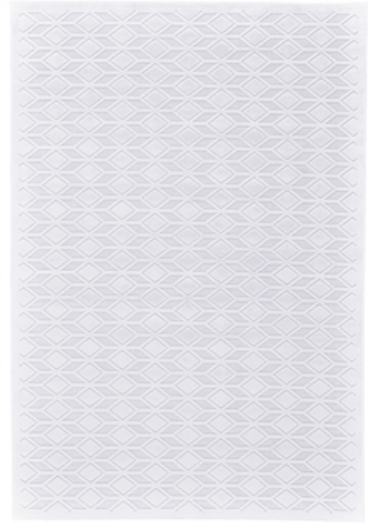
WHITE / WHITE