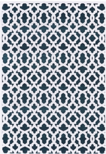
BLUSH / WHITE