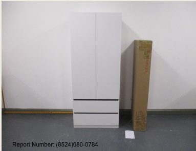
Report Number: (8524)080-0784

Twin Fins Corp 10830 Ada Ave, Montclair, California, 91730, United States