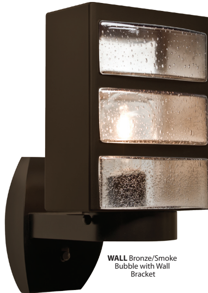
WALL Bronze/Smoke Bubble with Wall Bracket

UL or ETL Listed. Suitable for Wet Locations. May be used in Interior or Exterior applications.