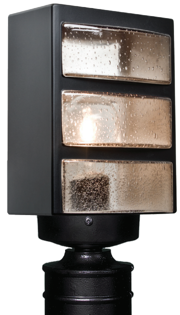
POST Black/Smoke Bubble with Post Fitter