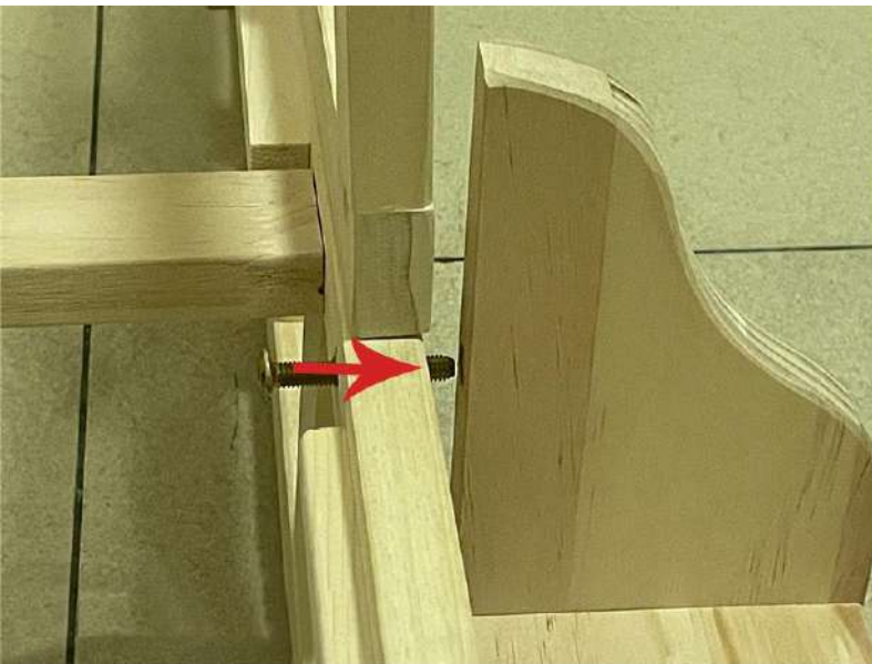
Install the screw on the right side of the staircase from the inside out