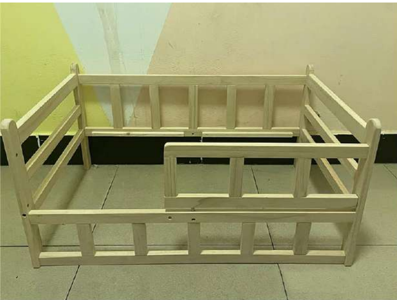
Install the front guardrail on the right side as shown in the picture