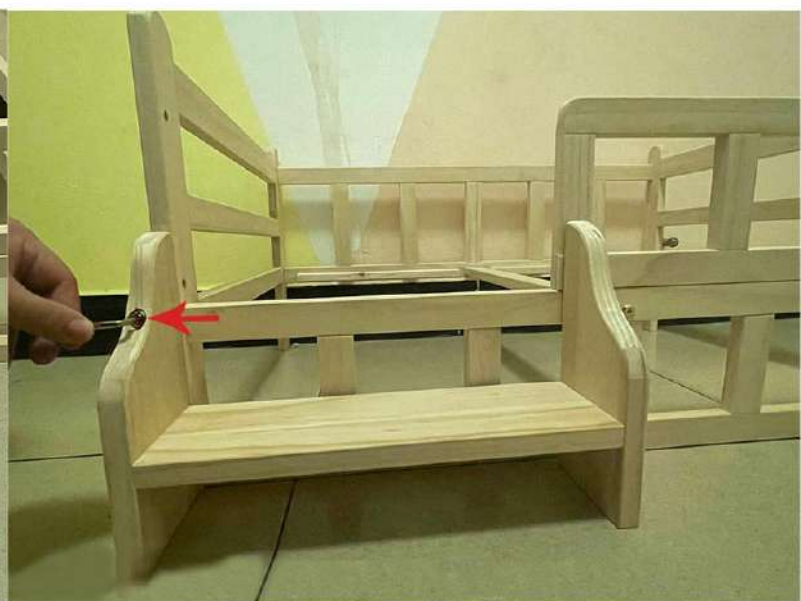
Install screws on the left front (the only position where long screws are used here)