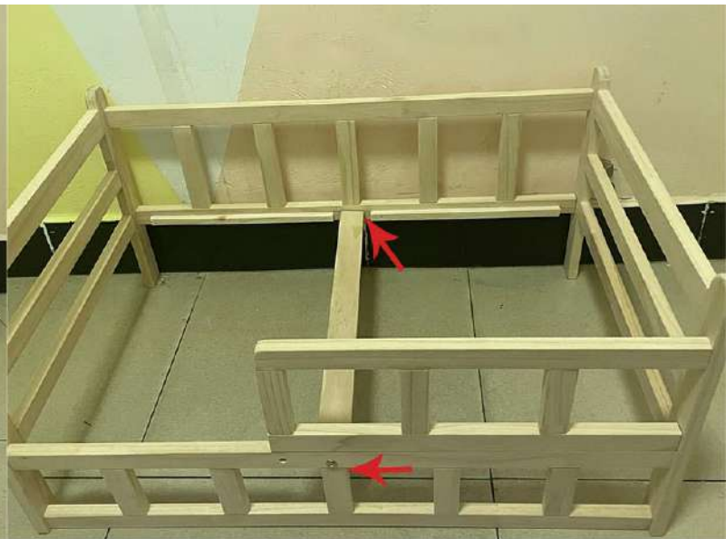
Install the crossbeam as shown in the diagram, and fix it with screws at both ends (S code without crossbeam)