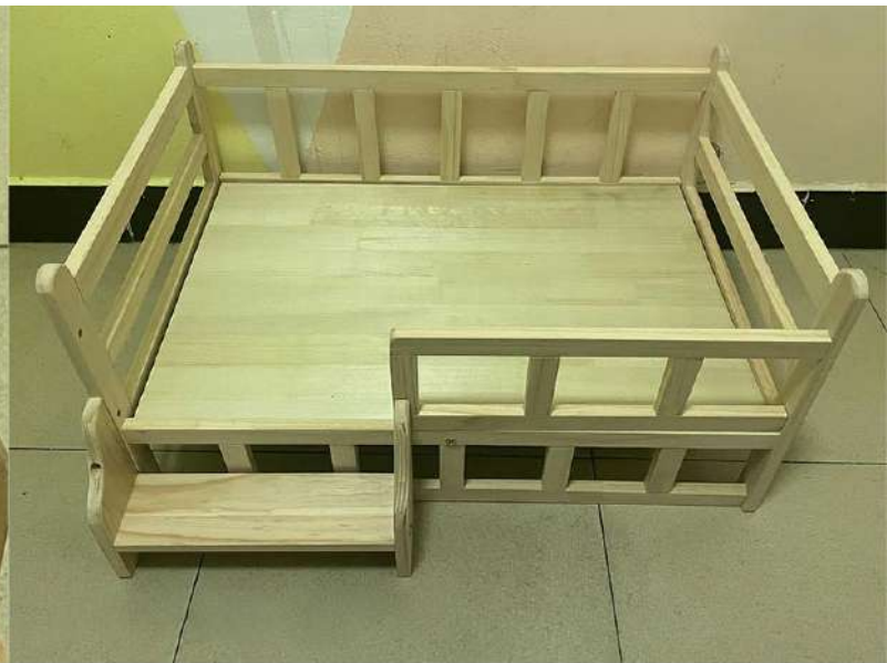
Finally, place the bed board and complete the installation.