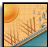
UV treated fabric