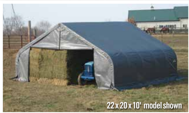
22 x 20 x 10' model shown

Thousands of options to custom fit your storage needs.