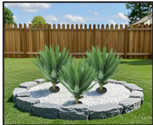
Step 4: Easily installed in soil or decorative planters.