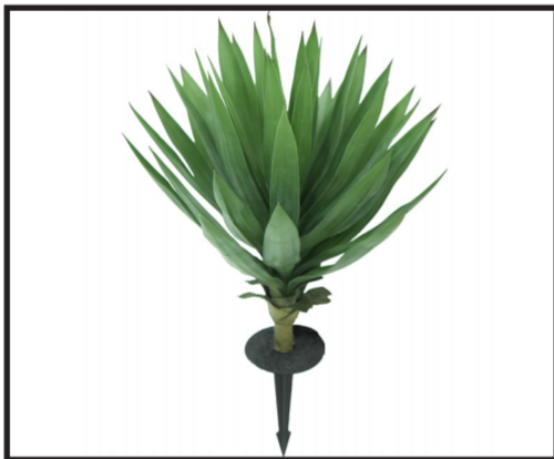
Step 3: Adjust the blade angle to make the leaf shape stretch and natural. (Warning: simulation design edge with barbs, need to pay attention to safety)