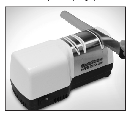
Figure 5. Serrated knife in Stage 2.

Do not sharpen in the Hybrid® any single sided, single faceted Asian Kataba knives, such as the traditional sashimi styled blade that is commonly used to prepare ultra thin sashimi. Stage 2 sharpens simultaneously both sides of the cutting edge while the sashimi knives are designed to be sharpened only on one side of the blade. The Chef'sChoice electric sharpeners listed in the previous paragraph will correctly sharpen these single sided knives.