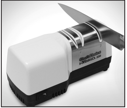
Figure 4. Knife in Stage 2. Use back and forth sharpening strokes with modest downward pressure. See text.