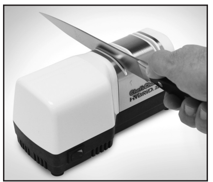
Figure 1. Inserting the blade in the left slot of the Stage 1. Alternate individual pulls in left and right slots.

Figure 2 illustrates how to check for the burr. Proceed as follows: If your last sharpening pull was in the right slot there should be a small burr on the right side of the blade edge. If the last pull was in the left slot there should be a small burr along the left side of the edge. If there is no burr make another pair of pulls and again check for a burr. Repeat making pairs of