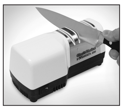
Figure 3. Inserting the blade in the right slot of Stage 1. Alternate pulls in left and right slots.

To resharpen follow the procedure for Stage 2 described above, making two to three (2-3) complete <u>back and forth stroke pairs</u> while maintaining recommended downward pressure. Listen to confirm the sharpening disks are turning. Then test the edge for sharpness. If necessary resharpen again but first use Stage 1 followed by two to three (2-3) back and forth pairs of strokes in Stage 2. Generally you should be able to resharpen several times using only Stage 2 before having to resharpen in Stage 1.