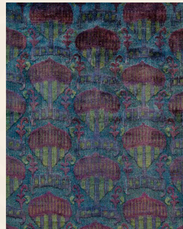
HIKMET - MARINE —————