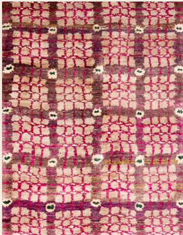
HENLEY - SILVER BERRY —————