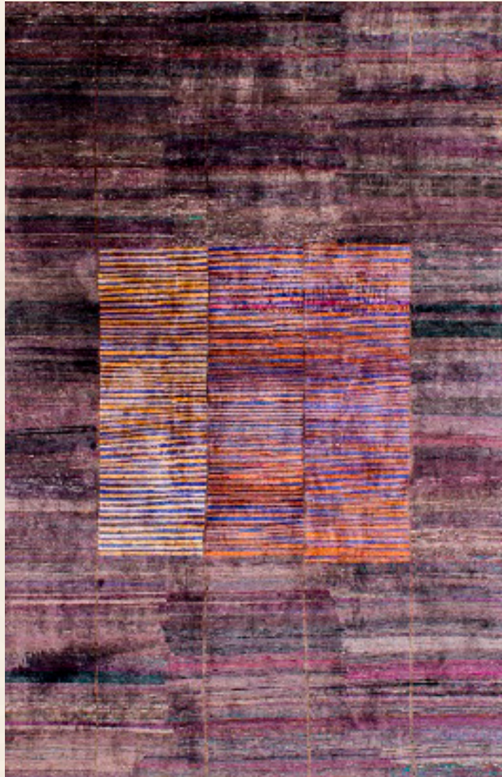
LLORCA - DUSTY PLUM

WOVEN CONCEPTS™ LEAVES A GREEN CARBON IMPRINT WITH THE CREATION OF EACH HAND-MADE RUG. WE IMPLEMENT RIGOROUS QUALITY AND ENVIRONMENTAL PRODUCTION GUIDELINES. AS A SOCIALLY RESPONSIBLE COMPANY, WE SUPPORT AND ADHERE TO INITIATIVES AGAINST CHILD AND FORCED LABOR.