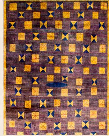
KIPLING - GUCCI —————