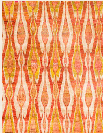
MILOSZ - CINNABAR ———