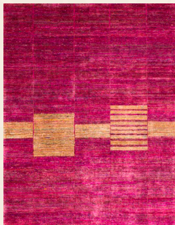
HAFIZ - CRANBERRY —————