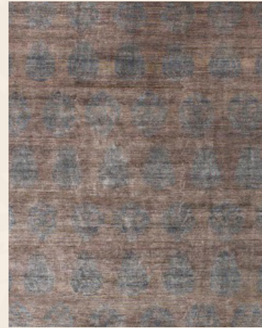
LYOKOS - STEAL BLUE ———