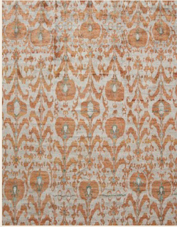
HIKMET - FUCSIA —————