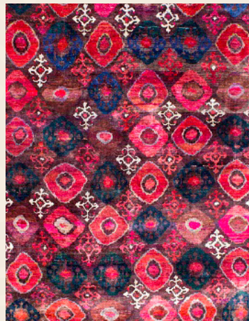
SAADI - CRIMSON —————