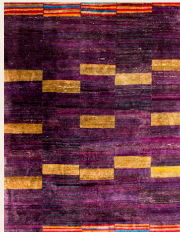
KHAYYAM - BYZANTIUM ———