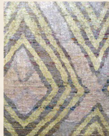
DESNOS - WASABI ———