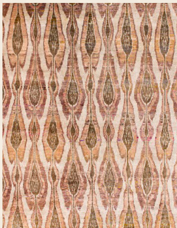
MILOSZ - PISTACHIO —————