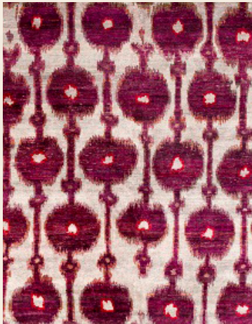
SOLINKA - GRAPE POM ———