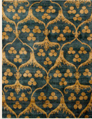
MILOSZ - CINNABAR —————