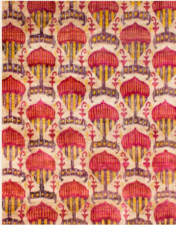
HIKMET - FUCSIA ———