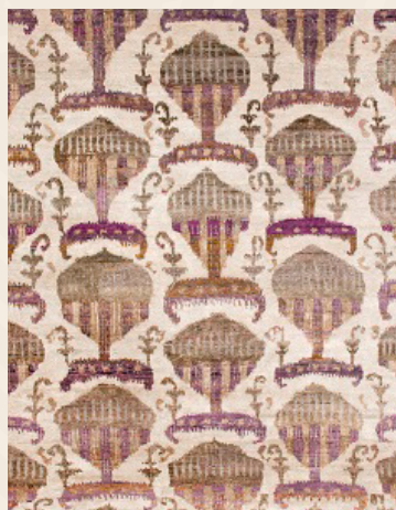
HIKMET - ANTIQUE GRAPE —