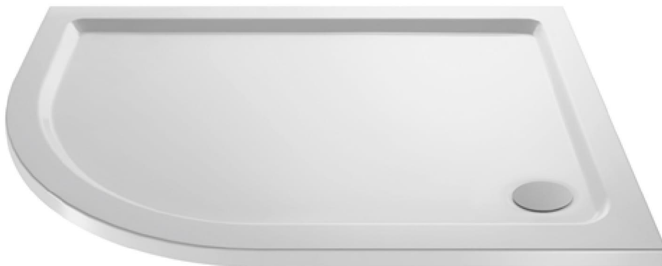
1000 x 900 OFFSET QUADRANT TRAY LH

DESCRIPTION: Offset Quad Tray Lh 1000X900x40