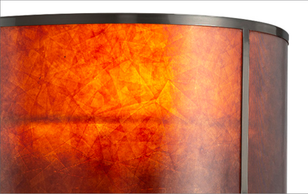
Natural Mineral Mica