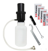
DRAFT SYSTEM CLEANING KIT