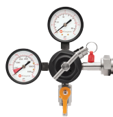
CO 2 REGULATOR