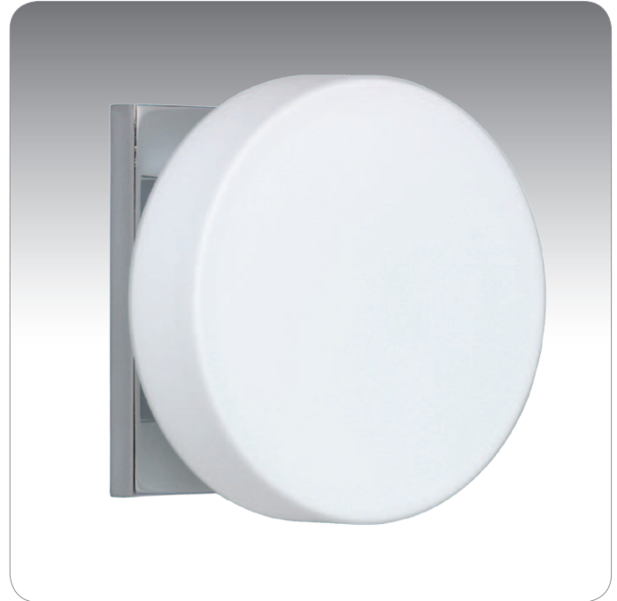
CIRO SHOWN IN OPAL MATTE (773807) IN CHROME FINISH