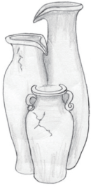
fountain body x1