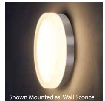
Shown Mounted as Wall Sconce