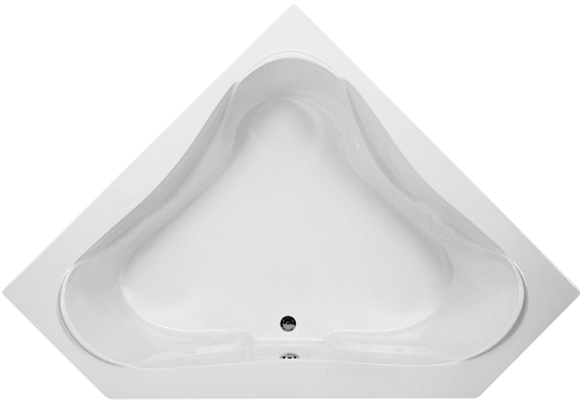
Features a textured bottom standard