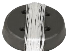
Anchor Weight 1x