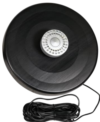
Float Ring with LED Sprayer 1x