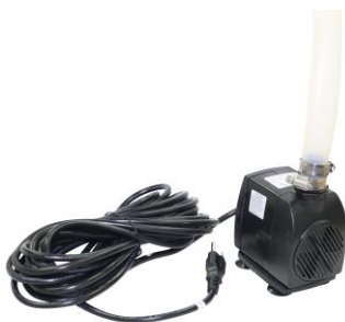
Fountain Pump 1x