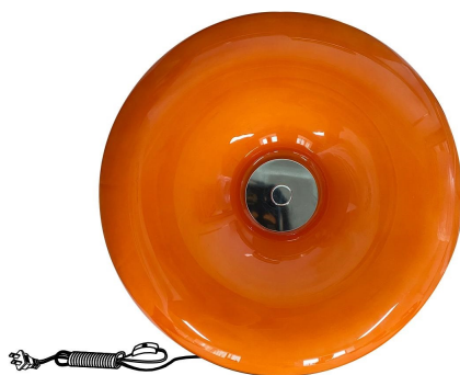
Table Lamp Voltage:110V-220V Bulb:LED