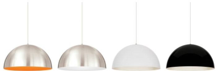
Satin Nickel/Sunrise Orange

Rated for (1) 150 watt max E26 medium base lamp (Lamp Not Included). LED includes 12 watt 1114.5 total delivered lumens, 3000K medium base LED G40 lamp surrounded by a blown white glass globe diffuser. Fixture provided with six feet of field cuttable satin cable. Dimmable with most LED compatible ELV and TRIAC dimmers.