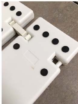
PUSH-IN RUBBER BUMPERS

HARDWARE PACK INCLUDES: (2) 1" DIA. STAINLESS STEEL WASHER (2) 1/4-20-UNC X 2-1/2" PHILLIPS TRUSS HEAD SCREW #3 DRIVE (2) 1/4-20-UNC NYLOCK-NUT (2) #12 X 3" PHILLIPS TRUSS HEAD SHEET METAL SCREW