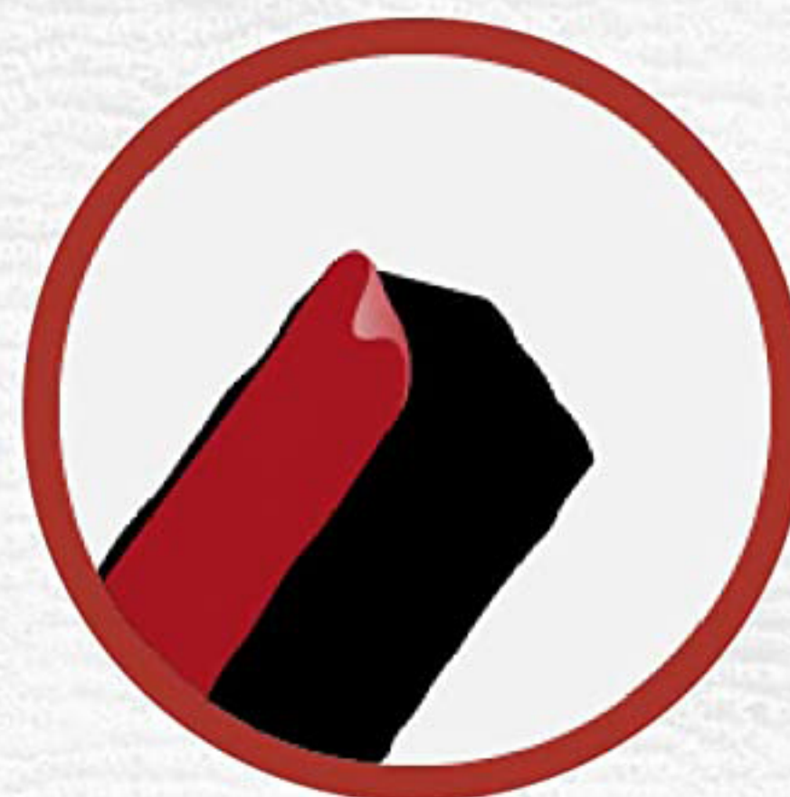
Step 1: Peel