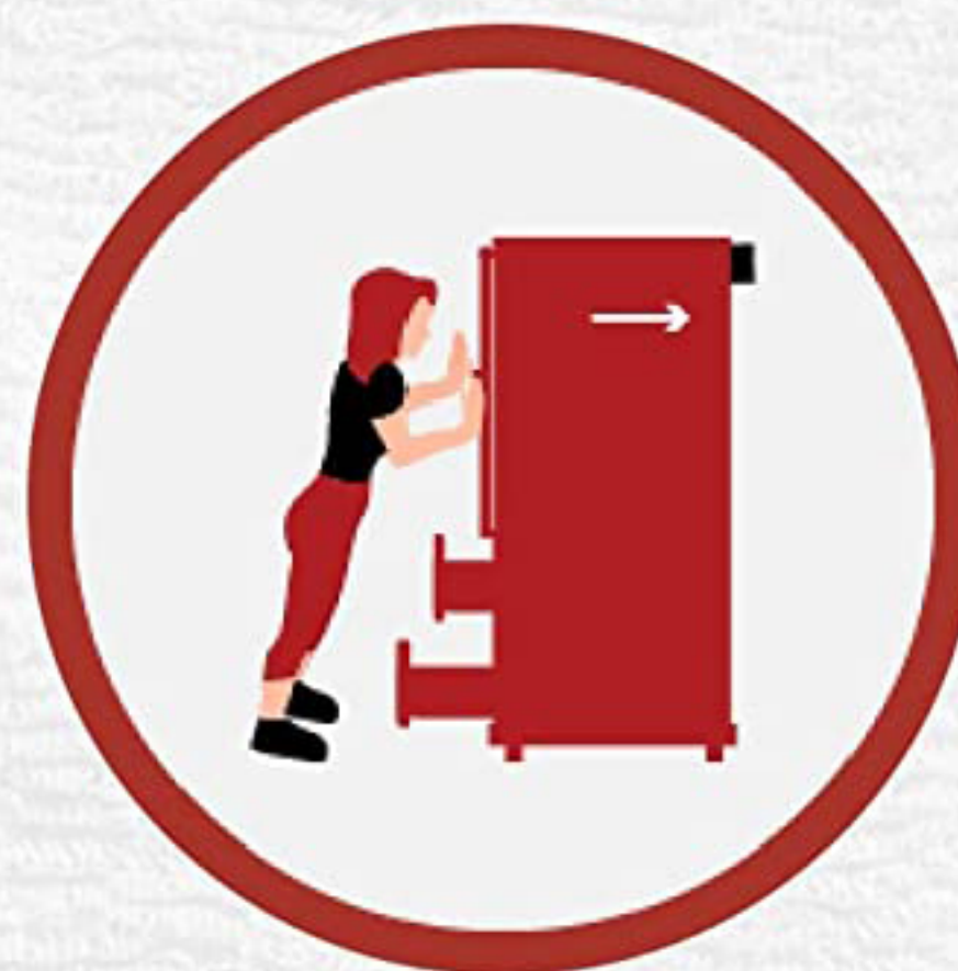
Step 3: Press