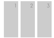
Numbered Back Panels

Thank you for your purchase. Your peel and stick wall mural set contains multiple panels. For your convenience, we've numbered the back of each panel. Simply hang the panels in the right sequential order to achieve the perfect wall mural.