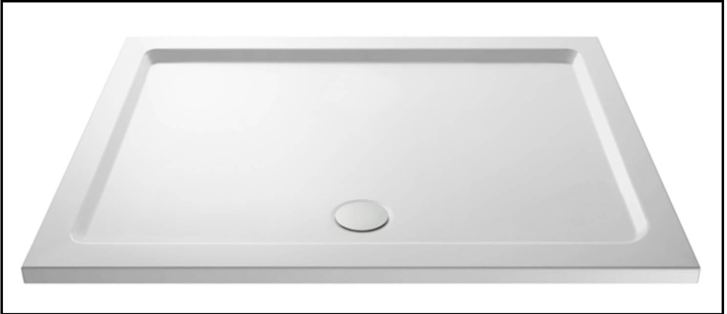
1400 x 900 RECTANGULAR TRAY