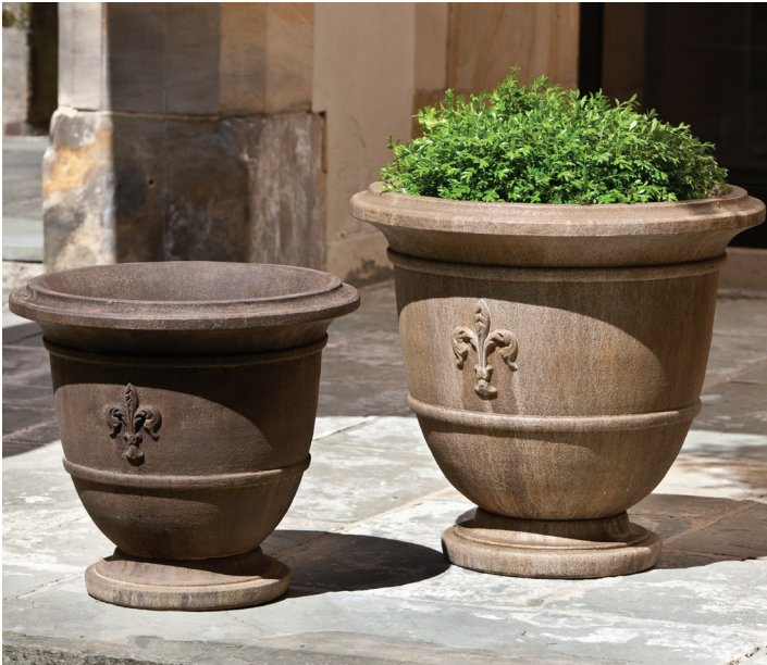
Shown in Pietra Nuova and Aged Limestone