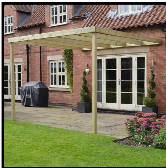
THE RUTLAND BOX LEAN-TO PERGOLA

10mm socket drive or spanner #2 Pozidriv screwdriver Platform or Step ladder Spirit level or laser level