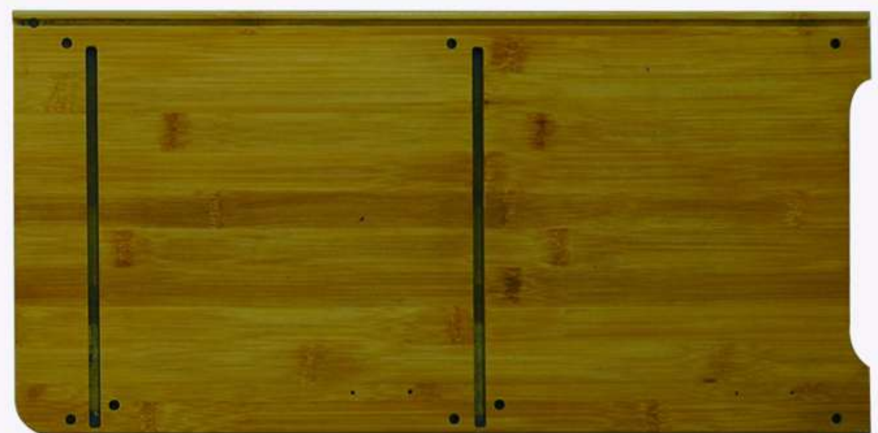
Side Left Bracket*1