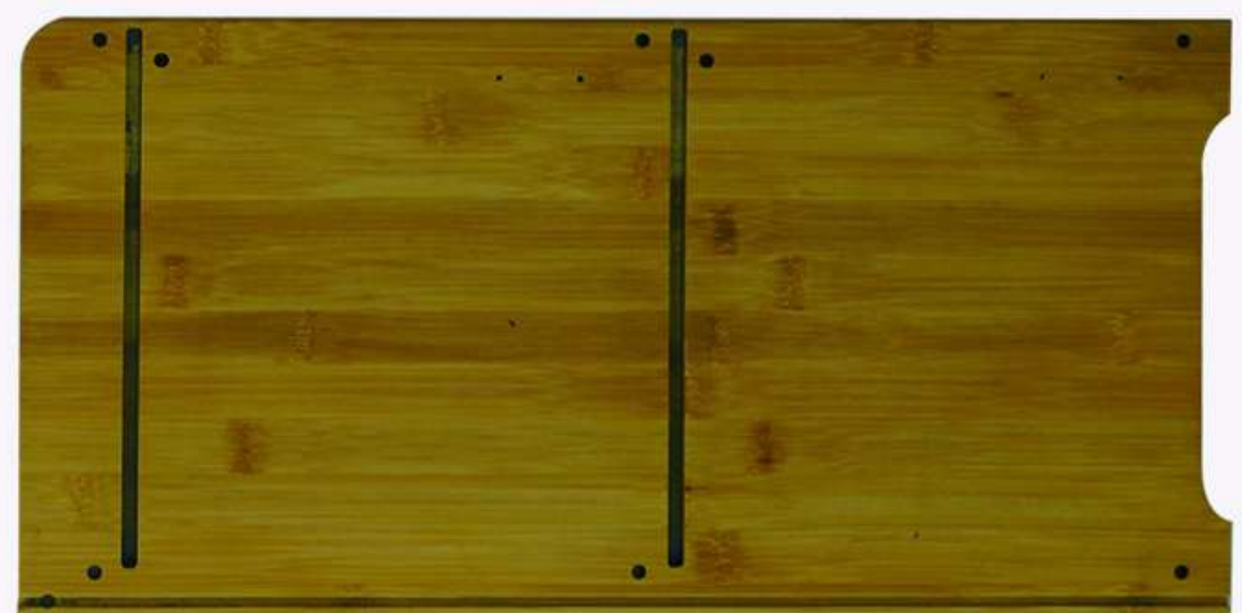
Side Right Bracket*1