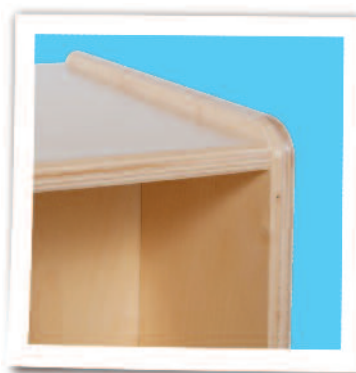
Typical Corners & Edges