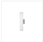
WS8418-BN Brushed Nickel