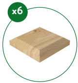
x6 3.5 in. x 3.5 in. Decorative Caps