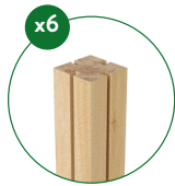
x6 17 in. x 2.5 in. x 2.5 in. Extra Tall Posts