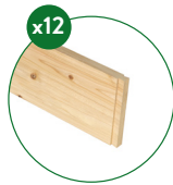
x12 4 ft. x 5.5 in. Boards