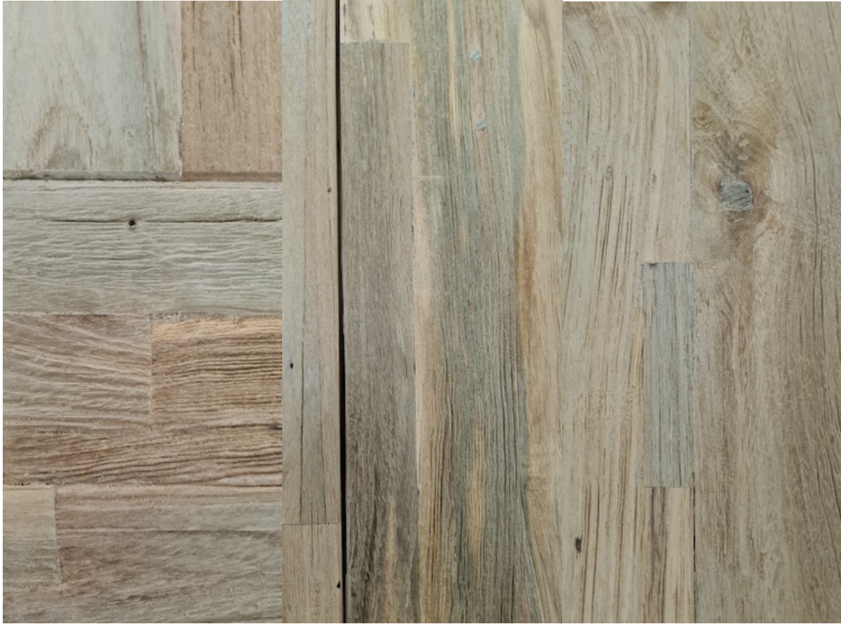
PATCHES & FINE CRACKS

One of the characteristics of recycled wood are its imperfections , hinting at its use in an earlier life. These imperfections are intentional and include laminations, patches, holes, minor variations in hue, minor scratches, dents, minor cracks, knotholes, inserts or other characteristics typical of up-cycled teak wood. None of these characteristics will affect the life of the product, but they will make the product uniquely yours.