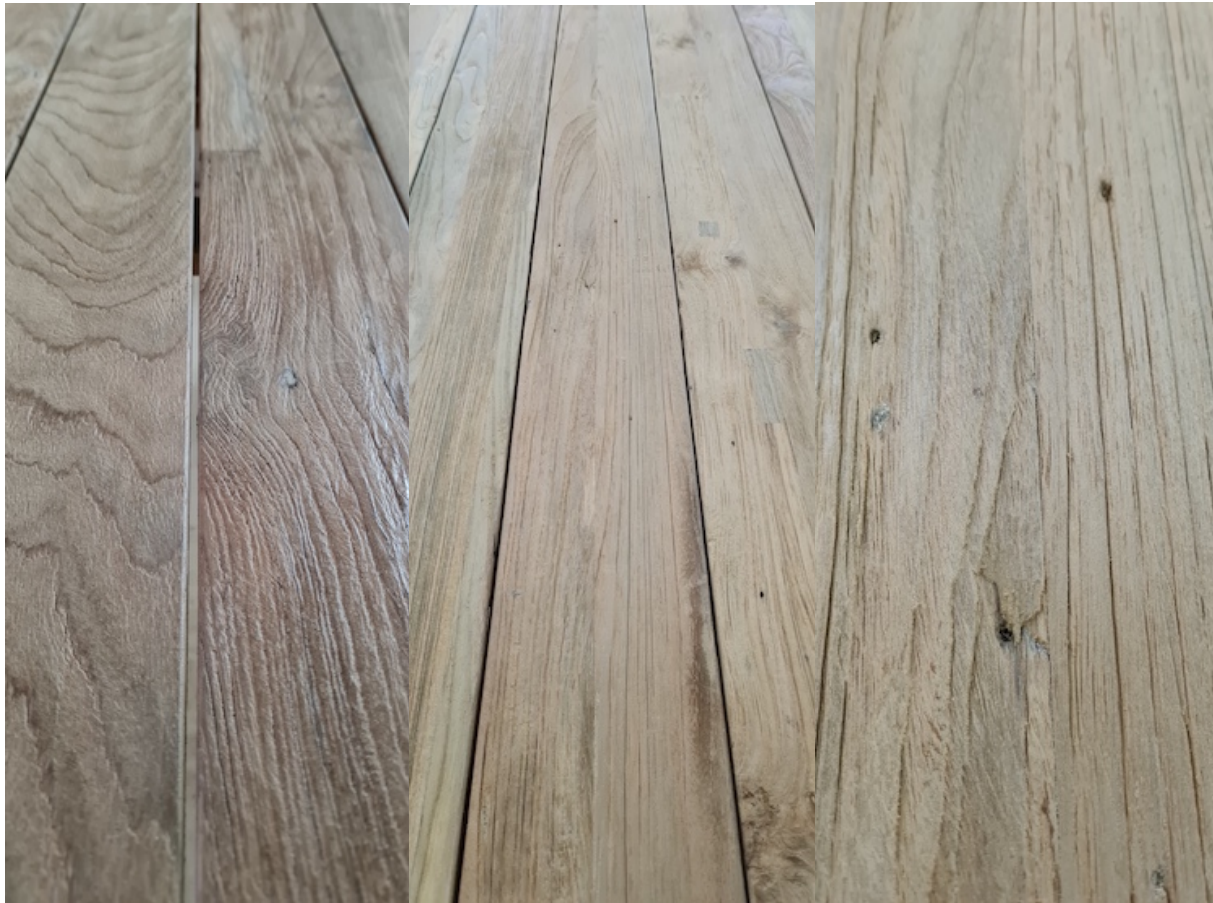
GRAIN & COLOR VARIATION NAIL HOLES

Sometimes some oxidation will occur around the areas where there were once nails in the wood. These may cause dark spots. Again, these are a feature of recycled teak products.