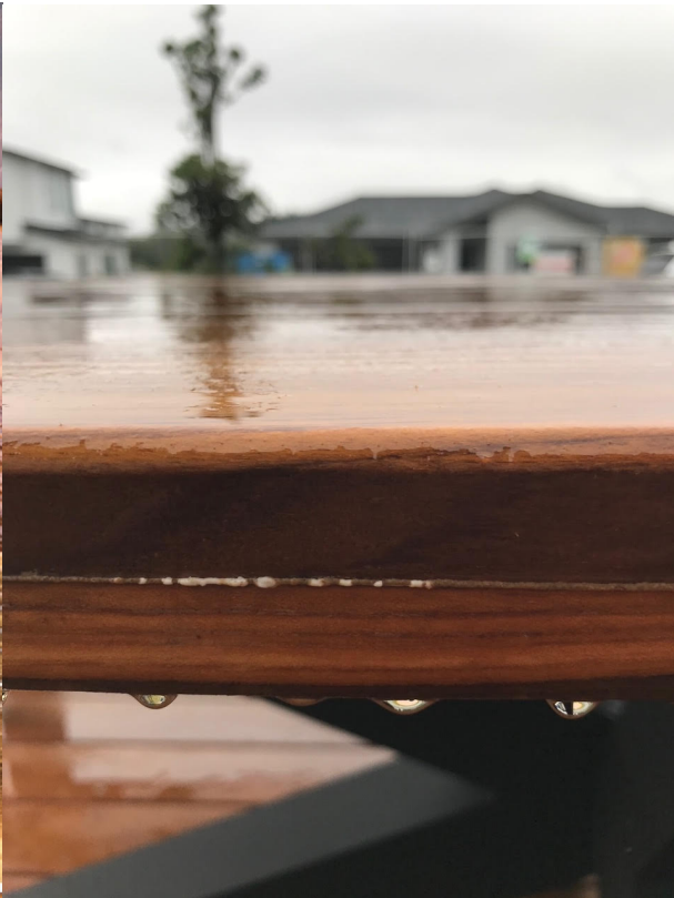
GLUE LINE AT LAMINATION